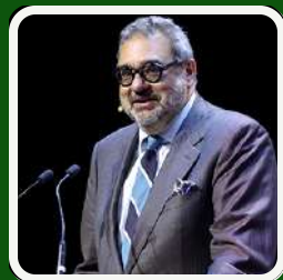
Yannis Exarchos OBS, Olympic Channel