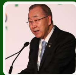
Ban Ki-Moon United Nations