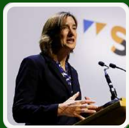
Katherine Grainger