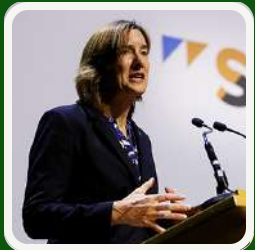
Katherine Grainger